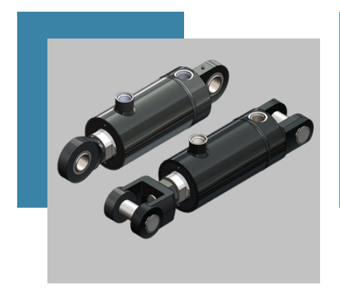
Standard Welded Cylinders