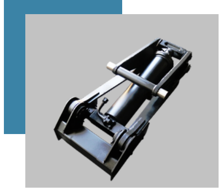
Dump Hoist Cylinders