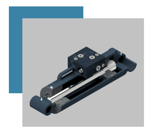
Custom Cylinders Valve mounted