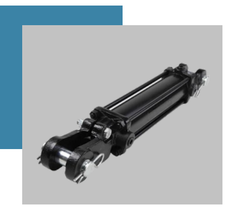
Tie Rod Cylinders